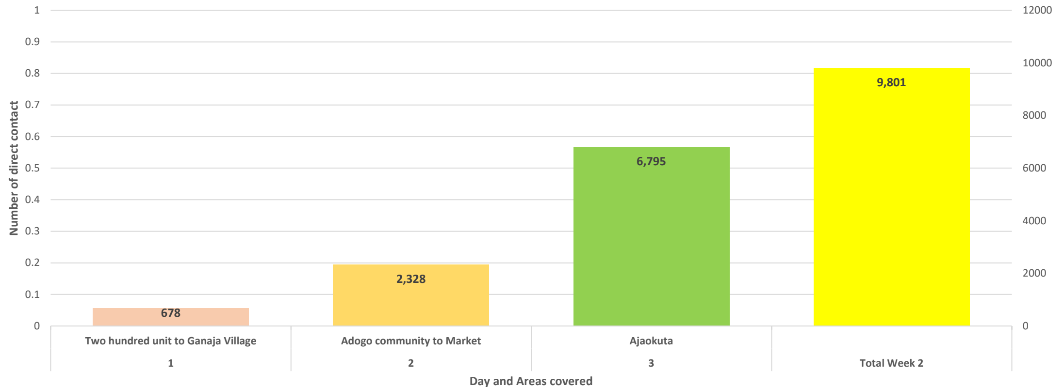
Number of people directly contacted during NVDC Voter Sensitization Outreach Program, Ajakuta LGA