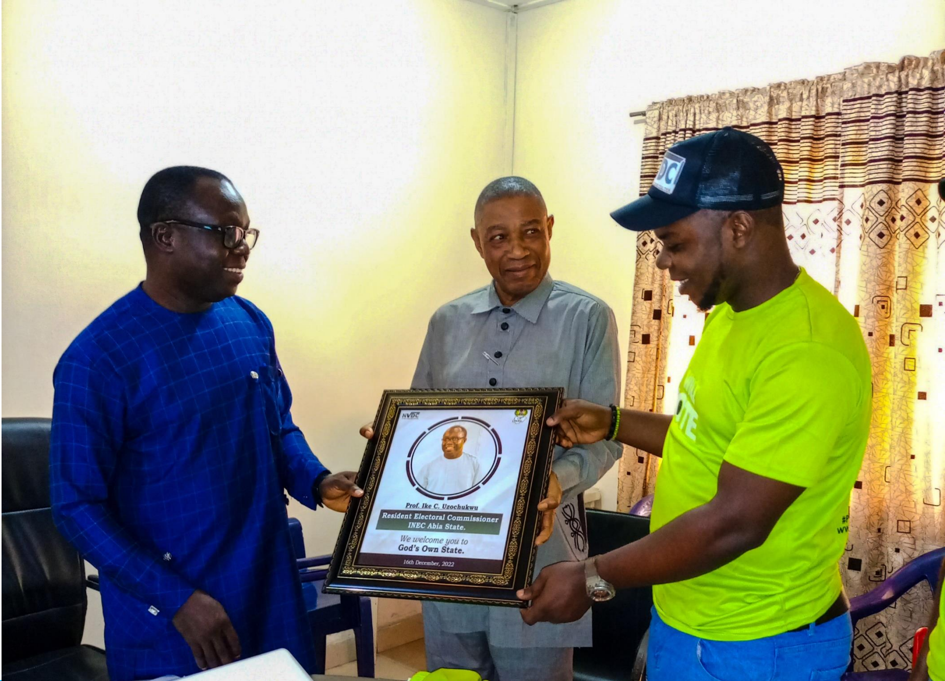
Welcoming the new REC, INEC, Abia State