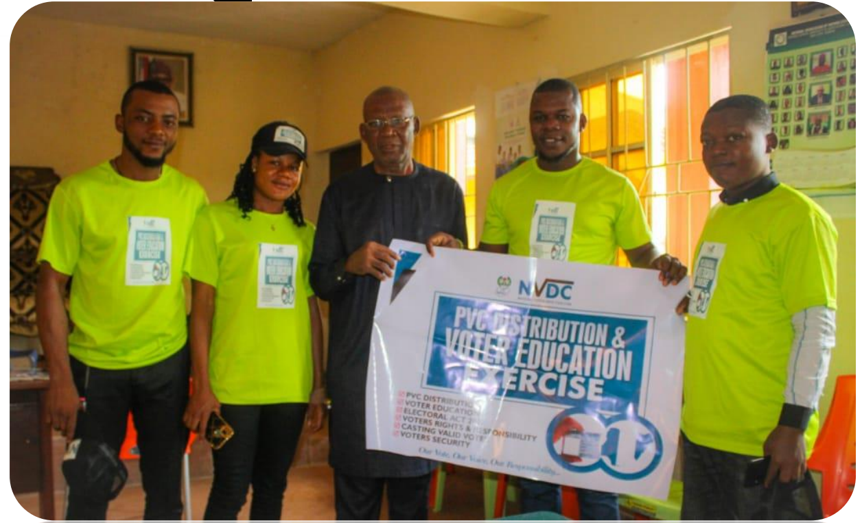
Traditional institutions are crucial to our security strategy. Revered Monarchs endorsed our project